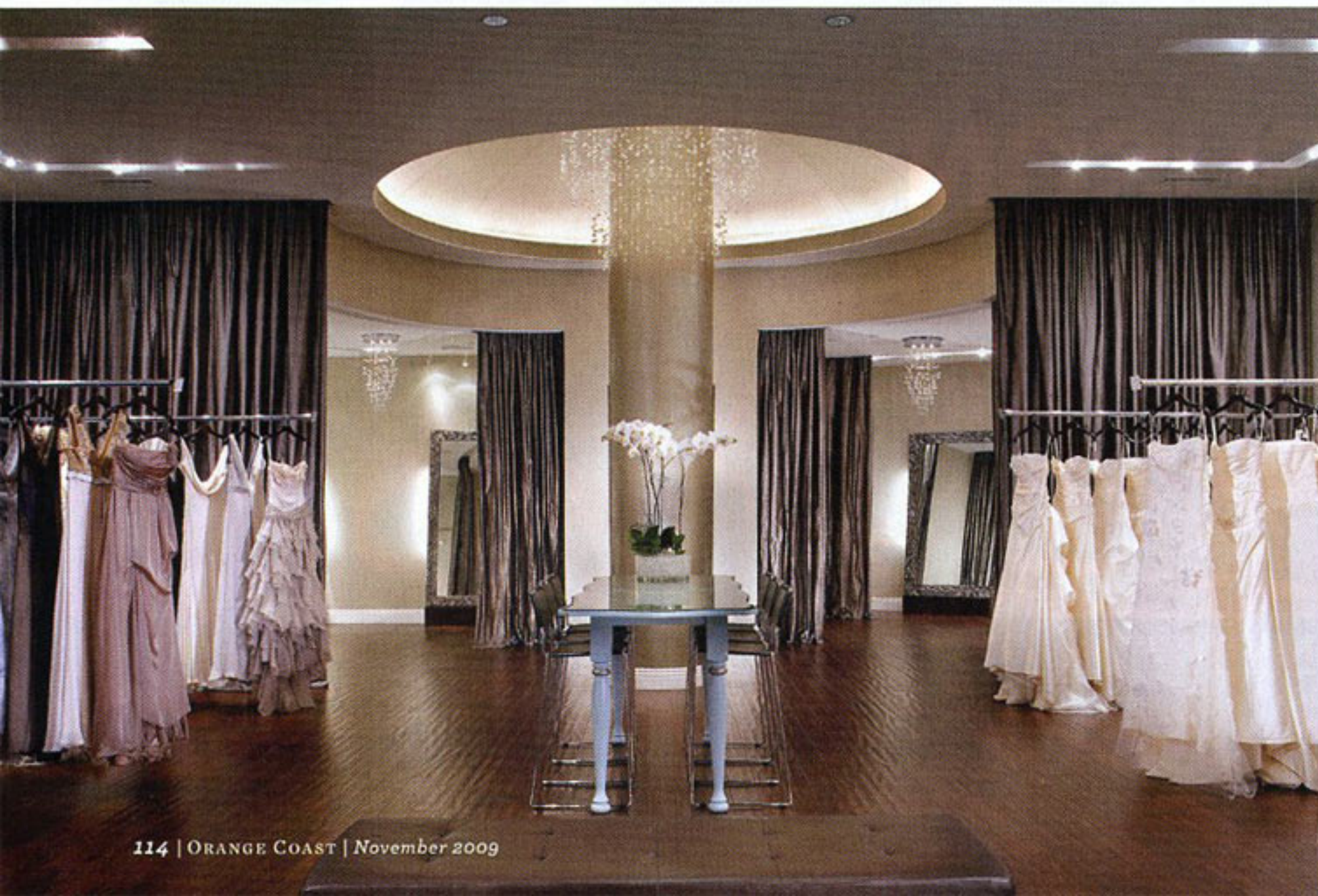
(BELOW) Creating a distinct retail space for a couture bridal line that was sophisticated, welcoming, and easily recreated in other locations was difficult on a tight budget and with a prominent structural column that needed to be incorporated into the design. A curtain of crystals illuminated above, glass beaded wall coverings, and floor to ceiling drapery defined dressing rooms radiate from the column to make it the store's focal point.