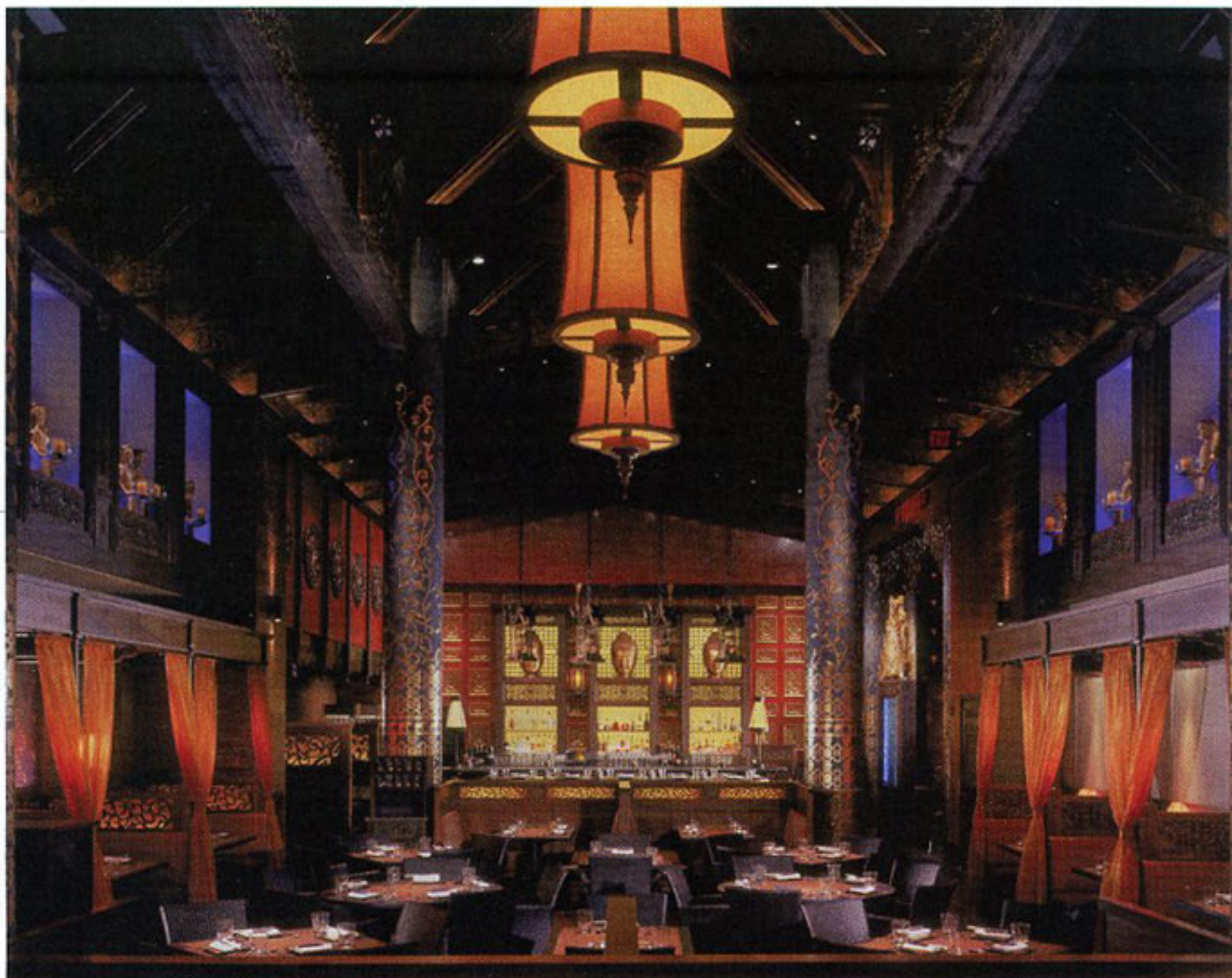
(ABOVE) Surrounding retail shops, a secluded entry, and an unusual building footprint were just a few of the challenges in this restaurant renovation for the Cheesecake Factory. Light, sound, and water decompress guests, while imported aged limestone floors, custom Chinese cabinetry and distressed millwork give the restaurant a distinct Southeast Asian flavor.